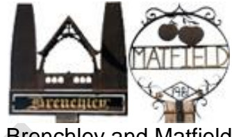
Brenchley and Matfield Parish Council