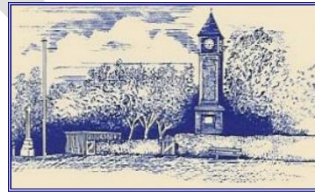
Sandhurst Parish Council