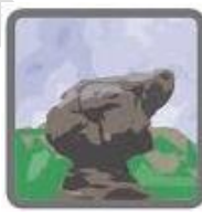
Rusthall Parish Council