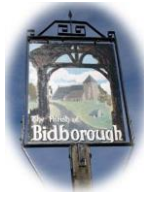
Bidborough Parish Council