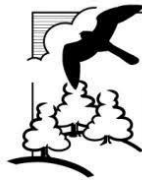
Hawkhurst Parish Council